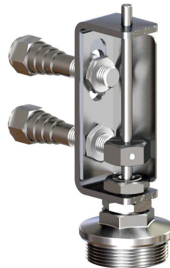
Proximity Limit Switch Assembly (Double Switch - SS9) (for illustration only)

This limit switch assembly is suitable for harsh environments, it is constructed entirely of 316 stainless steel, and is equipped with a rigid proximity magnetic switch sensor. The switch is suitable for hazardous locations, ATEX certified for Category II 2G EEx d IIC T6 and UL-Listed for Class I, Division 1, Groups A, B, C, D and Class II, Division 1, Groups E, F, G to NEC 500, NEMA 4, 4X, 7, 9. The switch is equipped with Tungsten contacts and is electrically rated for 2 Amps at 24VDC.